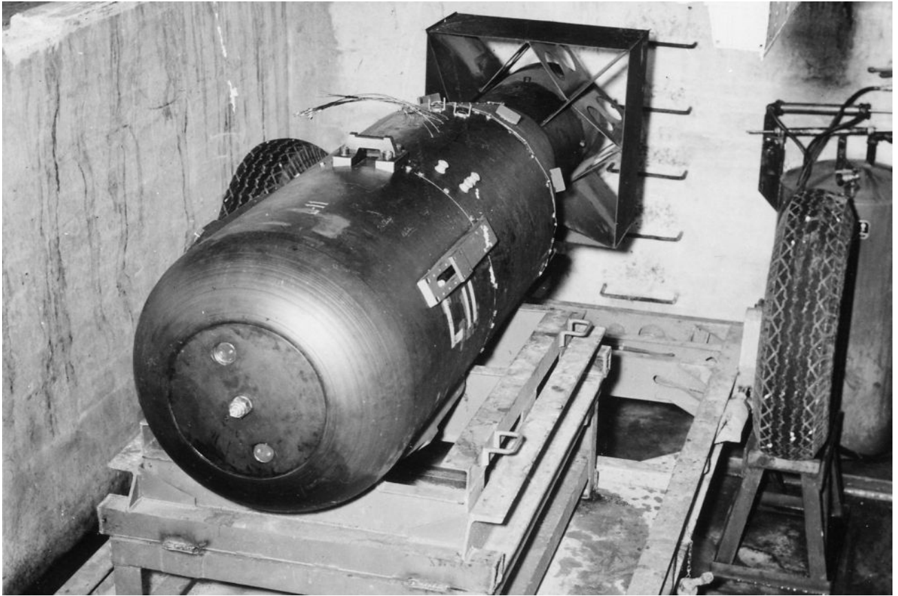
"Little Boy" unit on trailer cradle in pit on Tinian Island, Commonwealth of Northern Mariana, before being loaded into Enola Gay's bomb bay, August 1945