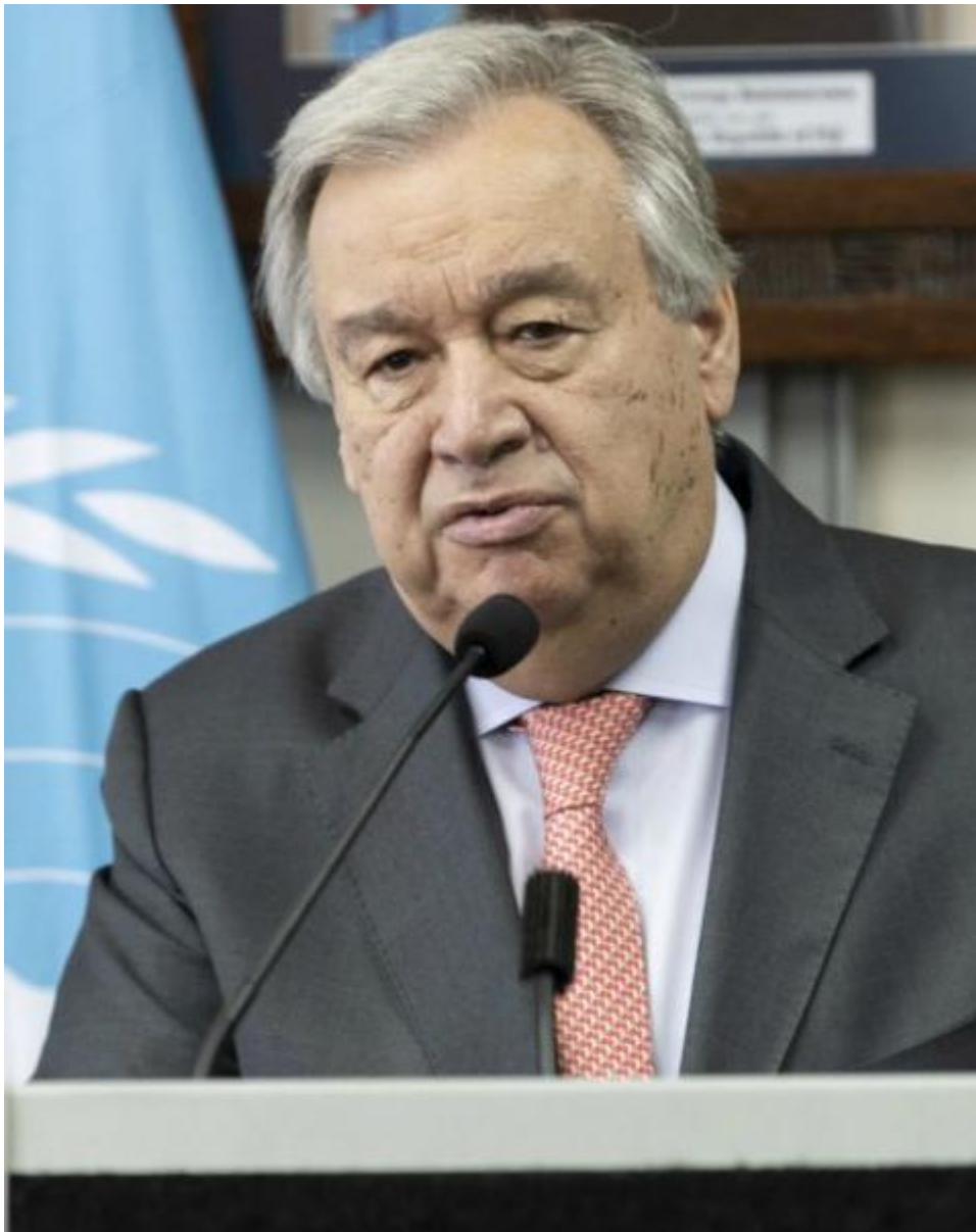
United Nations Secretary-General António Guterres

In addition to the nearly 14,000 nuclear weapons in the world, countries possessing such weapons "have well-funded, long-term plans to modernize their nuclear arsenals. More than half of the world's population still lives in countries that either have such weapons or are members of nuclear alliances."