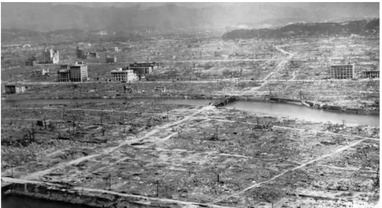
Hiroshima, Japan, Aug. 6, 1945