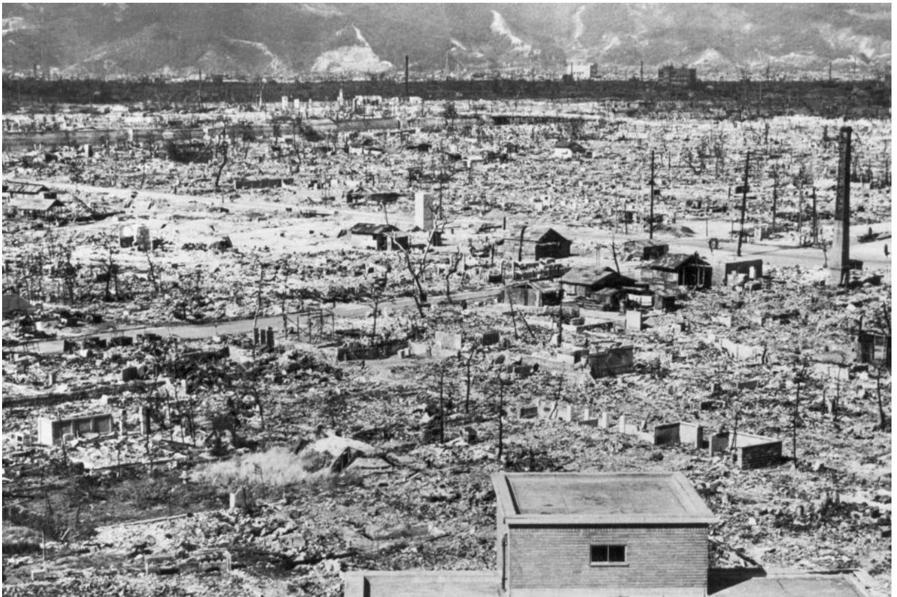
View from Red Cross Hospital, Hiroshima, Japan, after atomic bombing, 1945