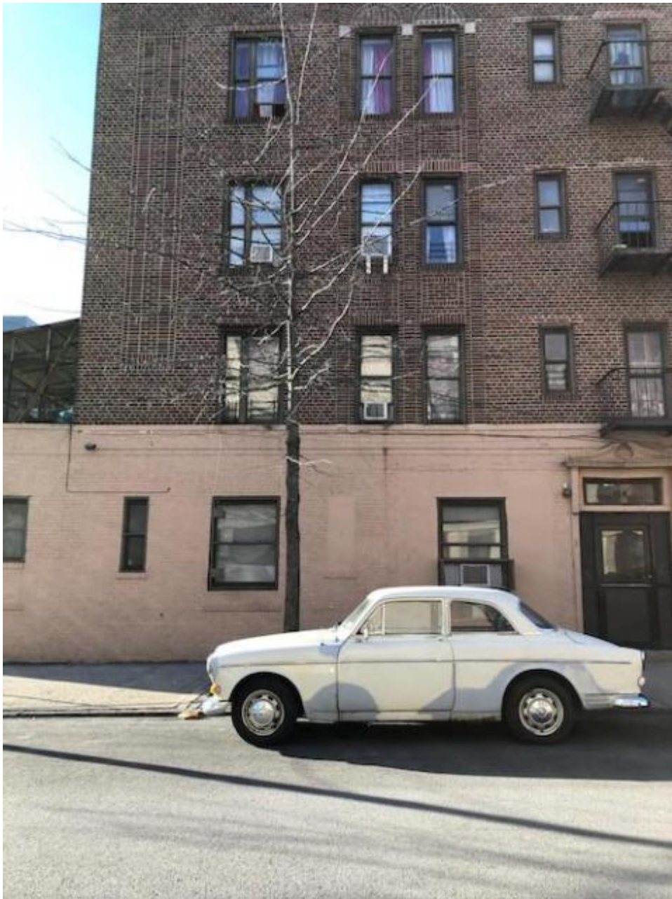
A midwinter day in the South Bronx

I didn't want to leave this life I had grown accustomed to. Here, I had again become captivated with Christ. I found him in the spiritual and material poverty. I found him in the face of the man selling roasted nuts in the square every evening. I found him in my children and our neighbors and the crossing guard who always made a point to smile and nod to me when I passed by. I had shed so many things in the Bronx, layers and layers of things that I identified as myself but really weren't me at all. I had given up running, piano, singing, comfortable living, relationships and so much more. Some of these skins were little, and some of them had wedged themselves