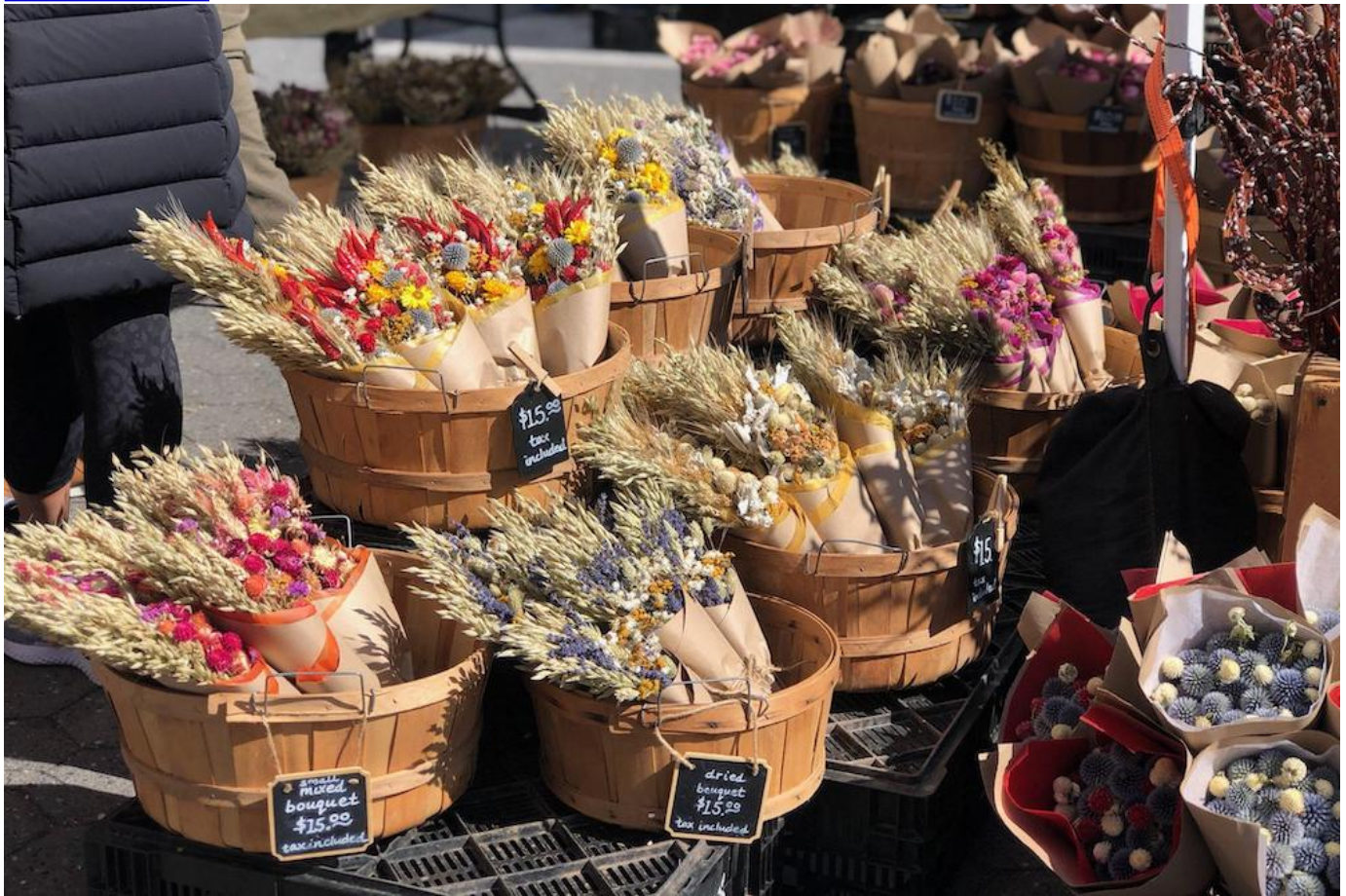
Flowers for sale at the Union Square market