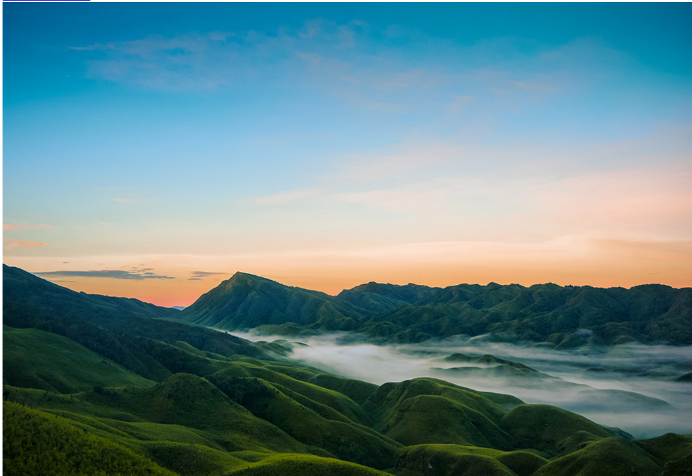
Dzukou Valley, Nagaland, India