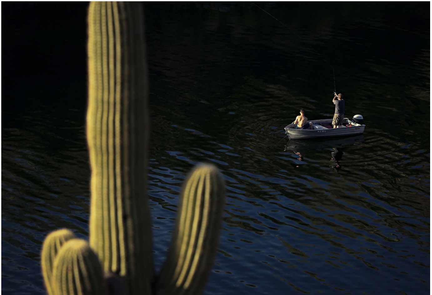
Men fish in Saguaro Lake in the Tonto National Forest outside Mesa, Arizona, in March 2016.

"The ownership and 'profiteers' of this mining proposal require closer scrutiny" over concerns that the Bank of China and other Chinese-backed businesses "hold a 30% stake in the mining company, Australian Rio Tinto, which is the primary owner of the local company, Resolution Copper LLC," the center said.