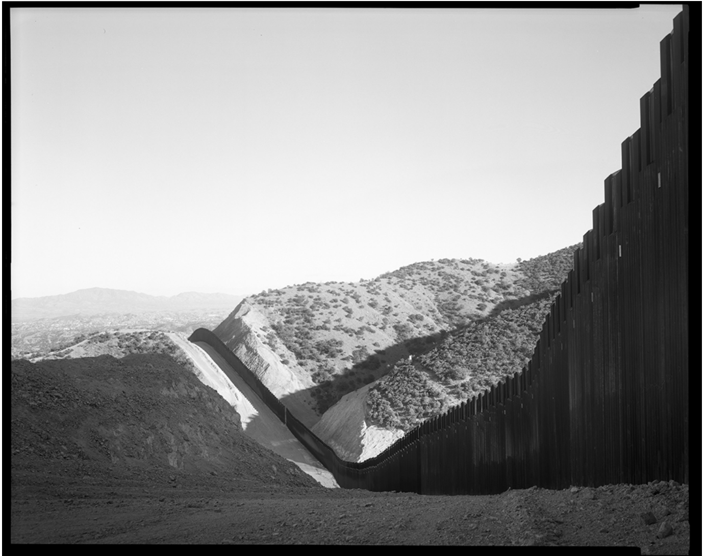
A view of the border wall looking toward Nogales, Arizona, on the left side of the wall, and Nogales, Mexico, on the right. Environmental activists and scientists say the 30-foot-high solid wall threatens animals such as jaguars and the Mexican gray wolf, and destroys natural habitats.