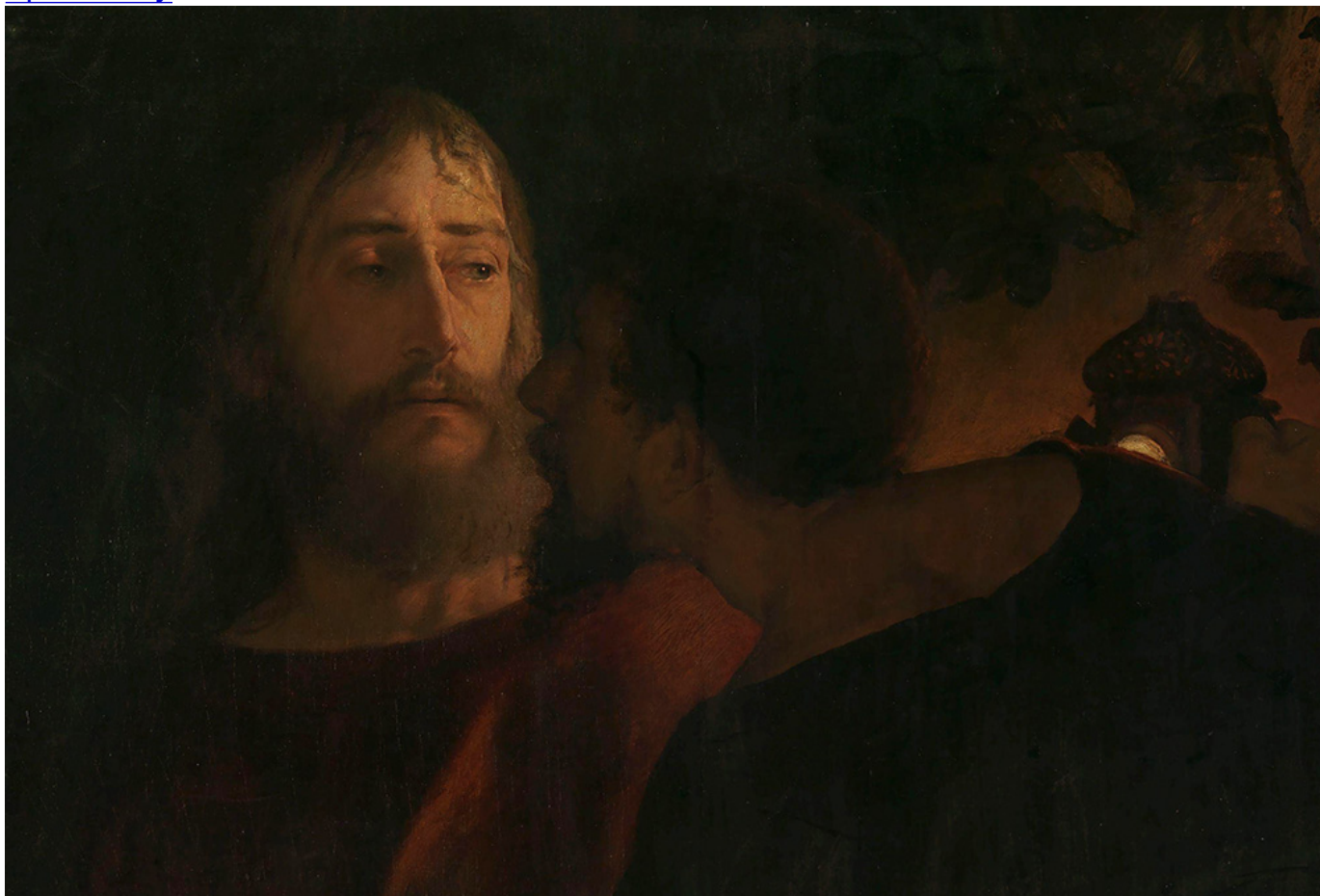
Detail of the 1878 painting "Judas Iskariot" by Eilif Peterssen