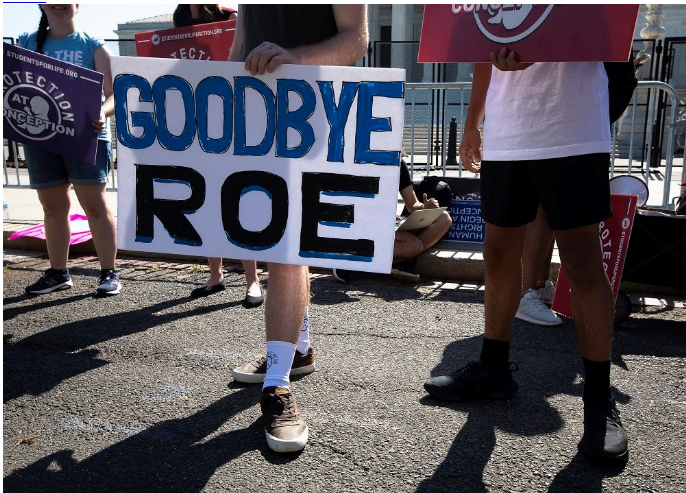
Demonstrators in favor of banning abortion gather June 15 near the Supreme Court in Washington.