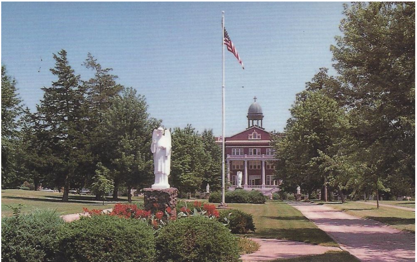
The campus of the Ursuline Sisters of Paola, Kansas, in an undated photo

Updating the motherhouse cost millions: It needed a sprinkler system, new flooring, paint, and extensive remodeling to meet its new use, the Republic reported.