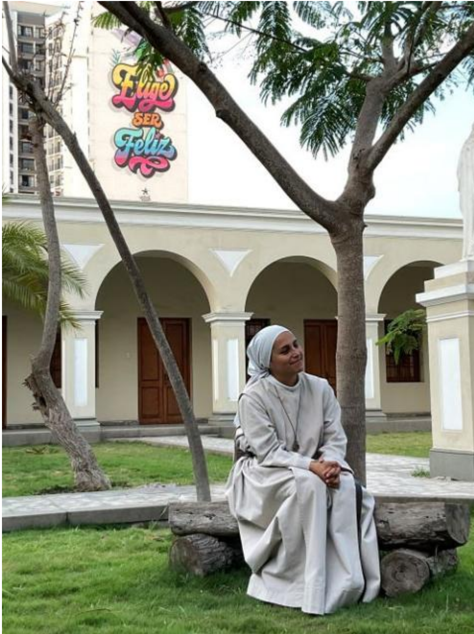
A sister prays in the cloister of the Monastery of the Incarnation in Lima, Peru.

live in pursuit of the comfort of a life with few surprises and, at the same time, with some emotions that embellish it.