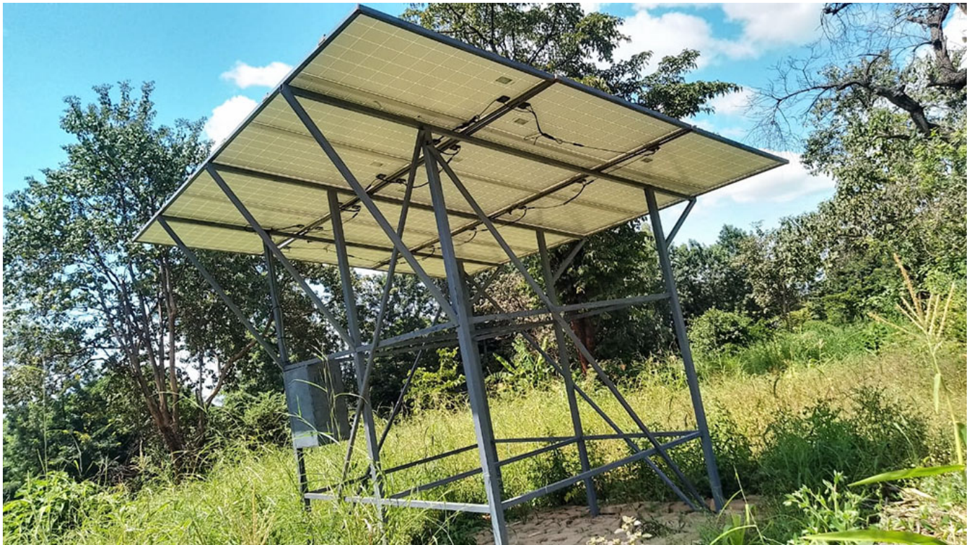
Solar panels power the borehole in Mashuru Community in Kajiado County, Kenya.

Currently, to ensure ongoing formation concerning care of the Earth, we run capacity-building programs on how to implement recommendations through community workshops, seminars and mentorship programs for learners and students in our schools, as well as the local community. These programs aim at creating awareness of the dangers of not caring for and protecting our common home, and teaching sustainable practices that are economically friendly, such as water-saving techniques, plastic recycling and afforestation.