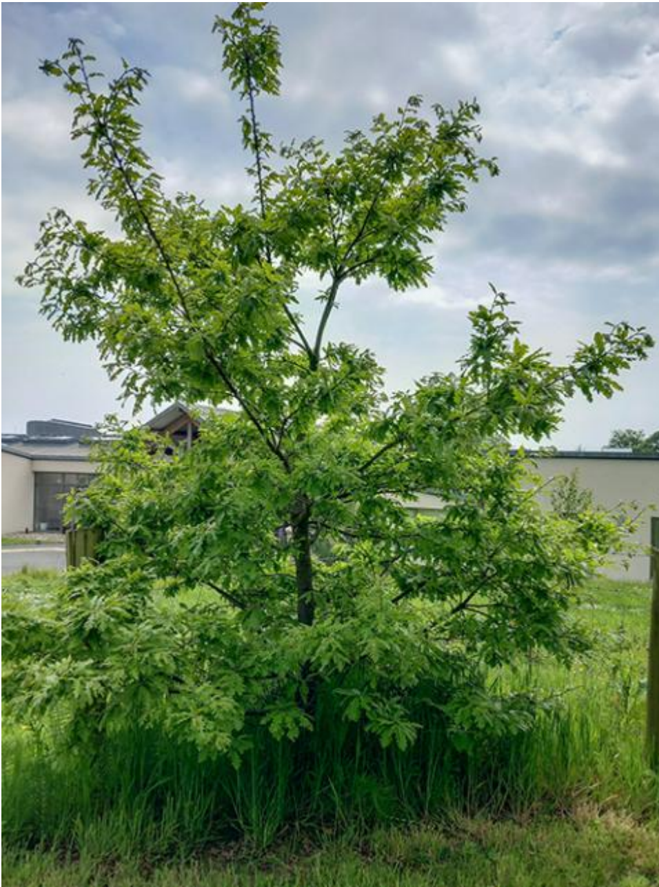
An oak tree planted in the grounds of the motherhouse of the Missionary Sisters of St. Columban in Wicklow, Ireland

Reading the above, while agreeing with what Pope Francis states, it would be easy to give in to despair and to give up. When he published his encyclical letter " Laudato Si' , on Care for Our Common Home," our congregation commissioned our first Laudato Si' group consisting of five sisters, each one on mission in different parts of the world. We are inspired and encouraged through their sharing with us the different efforts being made throughout the congregation to respond to the urgent cry of Mother Earth.