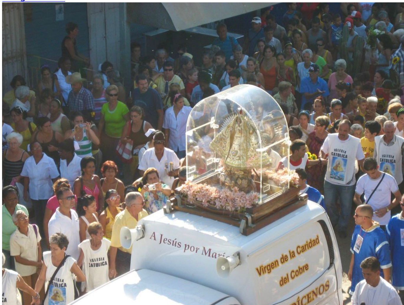
Virgen de la Caridad del Cobre passes through Melena del Sur, Cuba, in 2011.