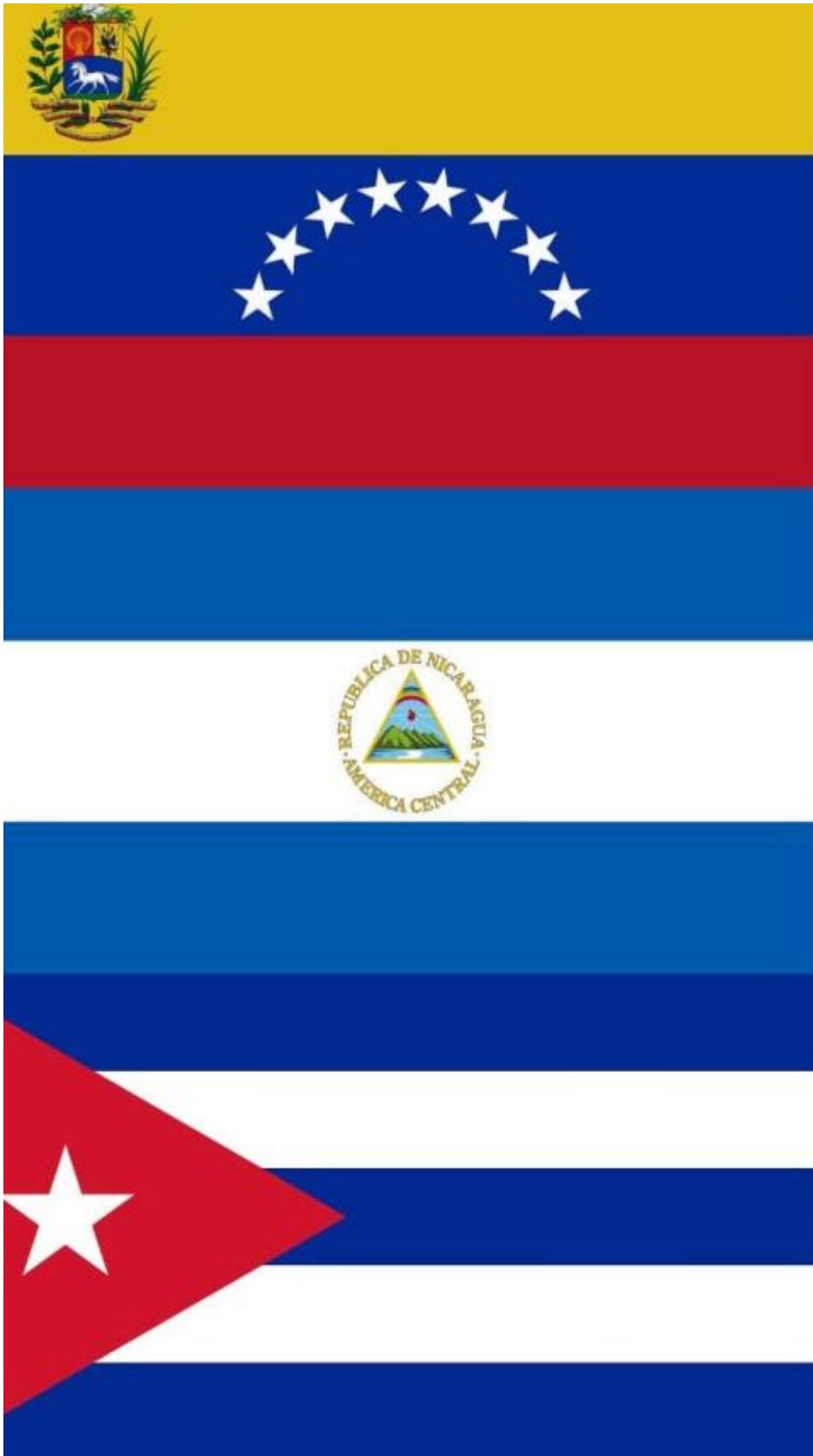
Flags of Venezuela, Nicaragua and Cuba