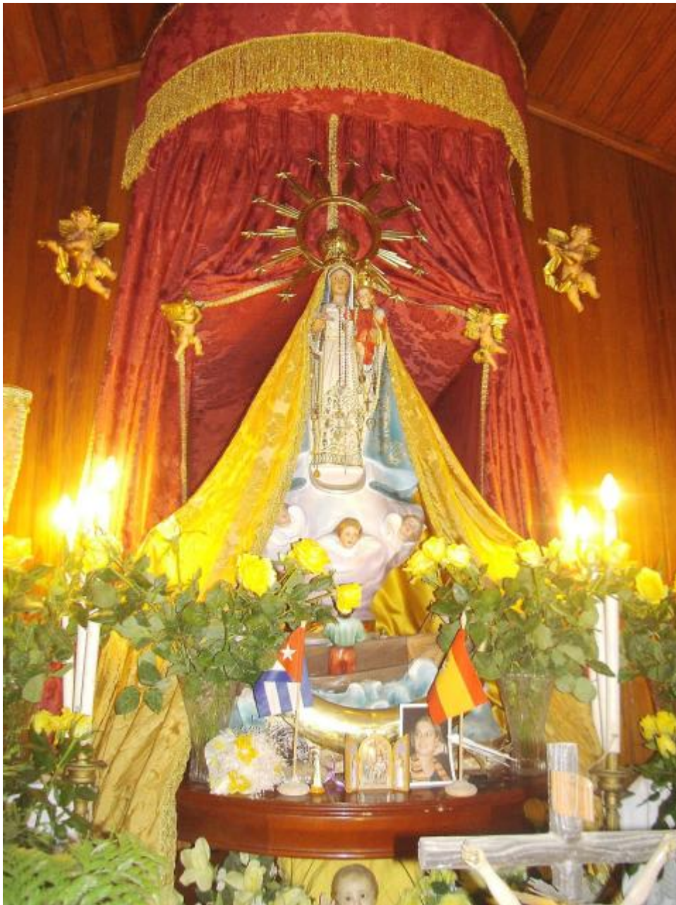
Ermita de la Caridad del Cobre hermitage in Tenerife, Spain

My prayer for you, dear Venezuela: do not lose heart, because you are reaching with your own hands the freedom that was taken away from you. May Our Lady accompany you, and may truth continue to prevail.