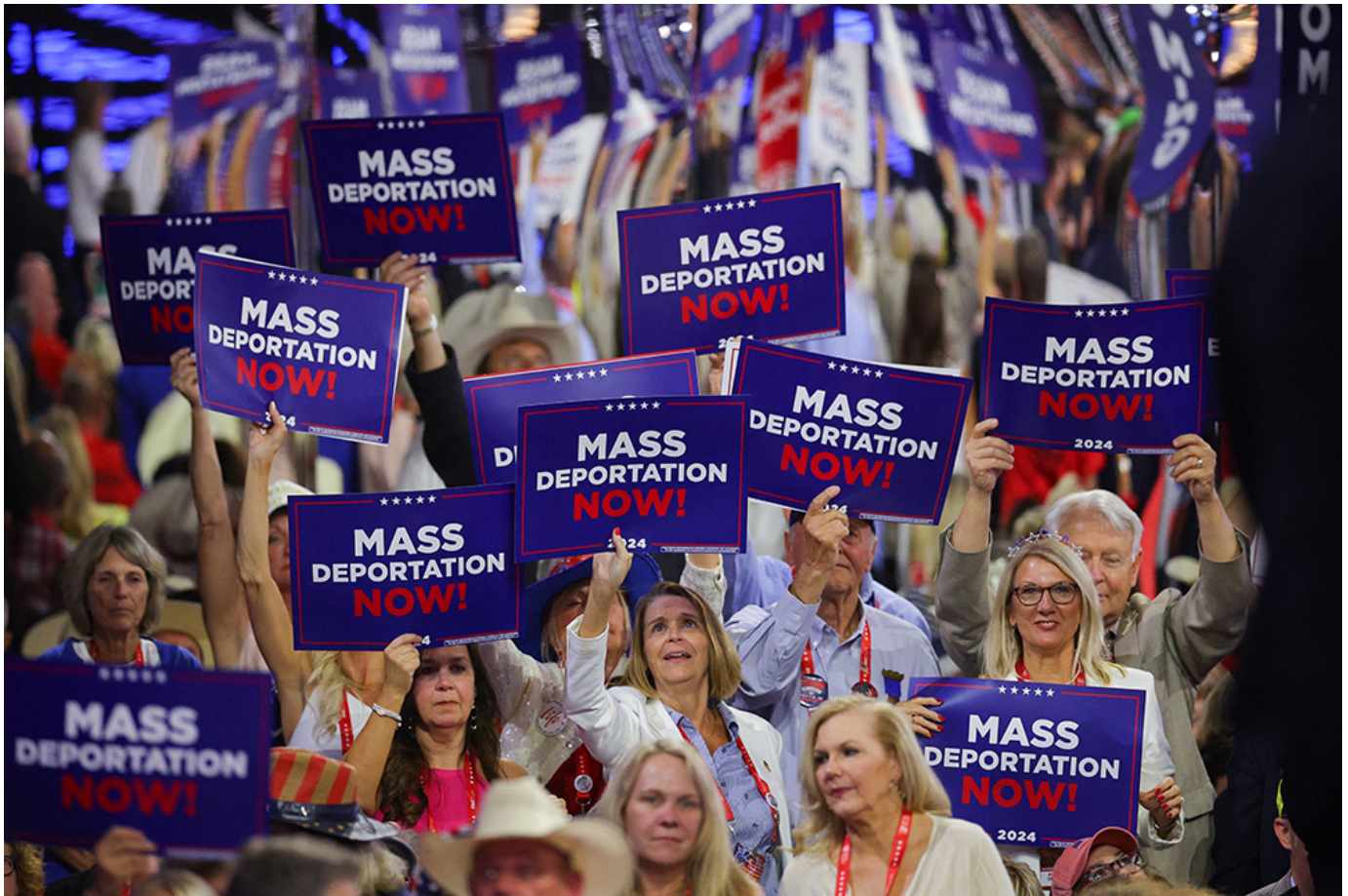
Delegates hold "Mass deportation now!" signs on Day 3 of the Republican National Convention at the Fiserv Forum in Milwaukee July 17, 2024.