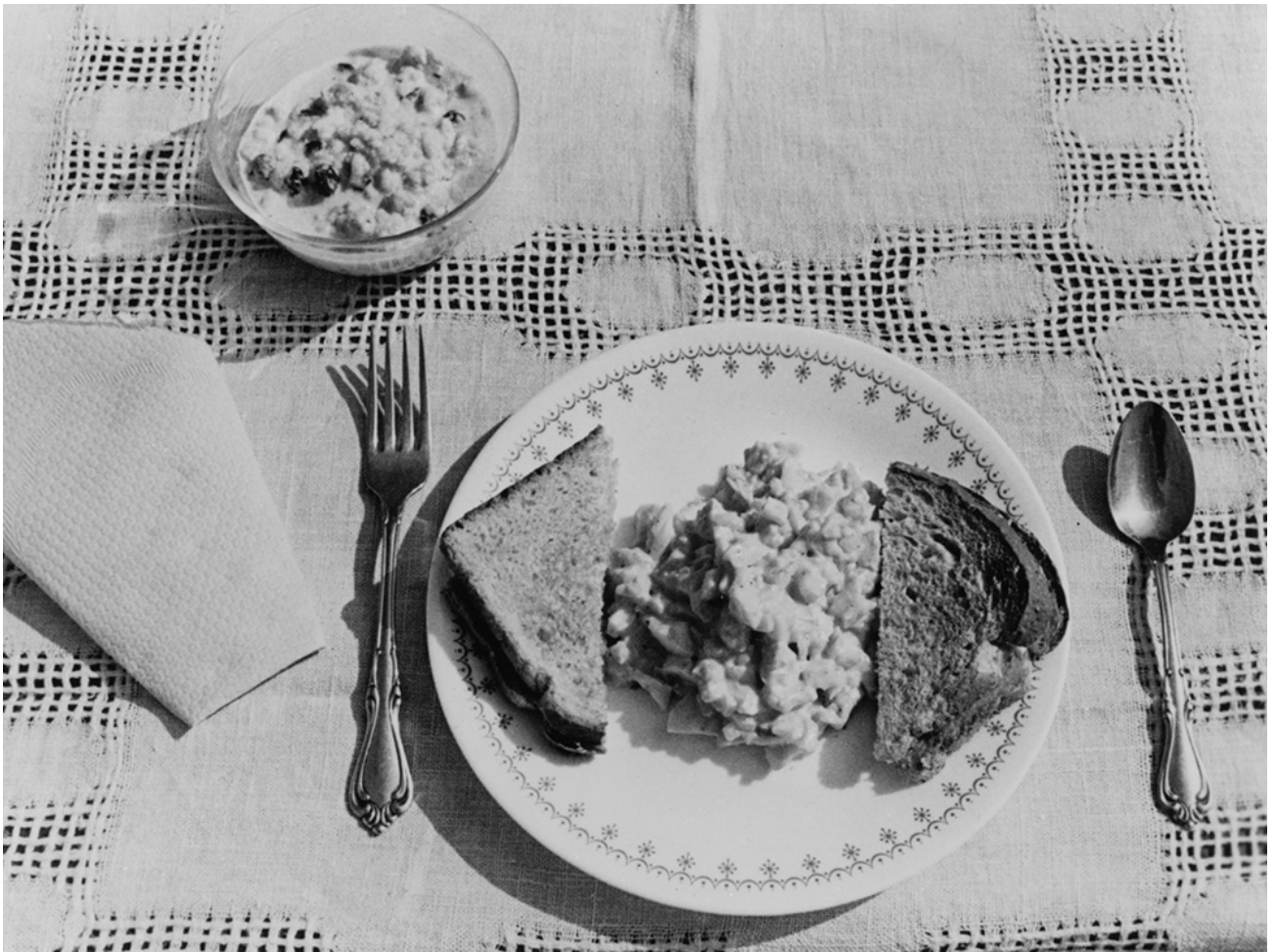
An example for a simple meal for the 1976 Operation Rice Bowl campaign consists of egg salad, toast and rice pudding.