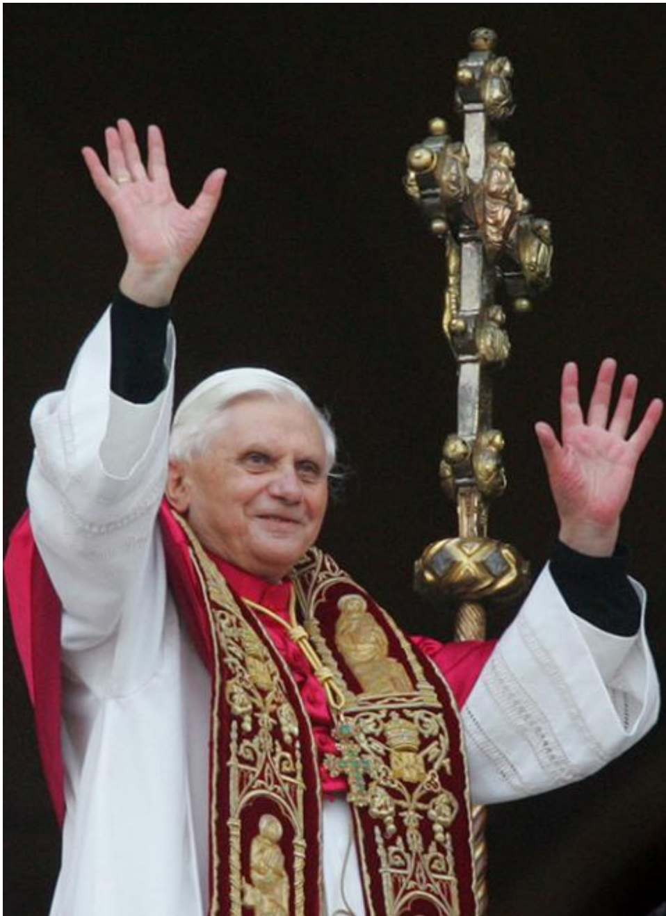
Pope Benedict XVI greets the world from St. Peter's Basilica after his election April 29, 2005.

Ratzinger's decision to take the name of Benedict XVI could be based on a number of historical factors. St. Benedict is the patron saint of Europe, a continent that has seen a sharp decline in church attendance under John Paul II. Ratzinger left Rome the night of before John Paul died to attend an award ceremony at a Benedictine monastery in Subiaco, Italy, where he was given the "St. Benedict Prize for the Promotion of Life and Family in Europe."