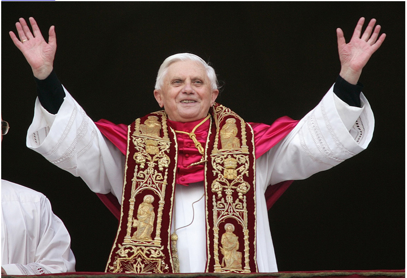
Pope Benedict XVI greets the world from St. Peter's Basilica after his election April 29, 2005.