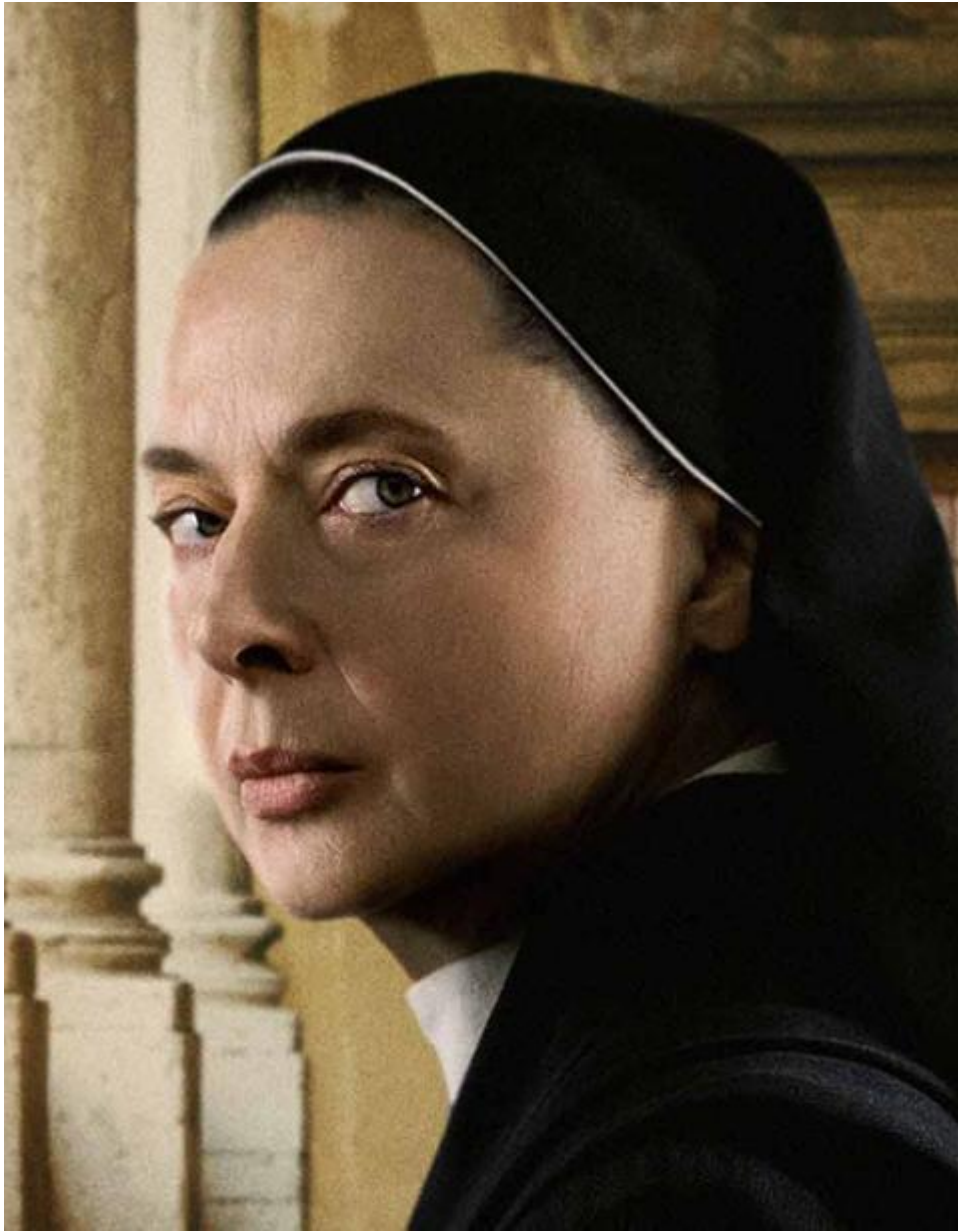
Isabella Rossellini in "Conclave" (Focus Features)

The 2024 film " Conclave " highlighted the vital but often thankless work of religious sisters. Ironically, the male characters in "Conclave" are gossipy, emotive and melodramatic, adorned in lace and finery. Meanwhile the character Sister Agnes, portrayed by Isabella Rossellini, is resolute and self-disciplined. Sister Agnes is hard to pigeonhole, neither old nor young, neither a font of divine wisdom nor a sheltered ingenue. Like the archetypal mother superior, she is intelligent and decisive, but her wisdom seems to derive, not from some supernatural line to God, but from her own experience and judgment.