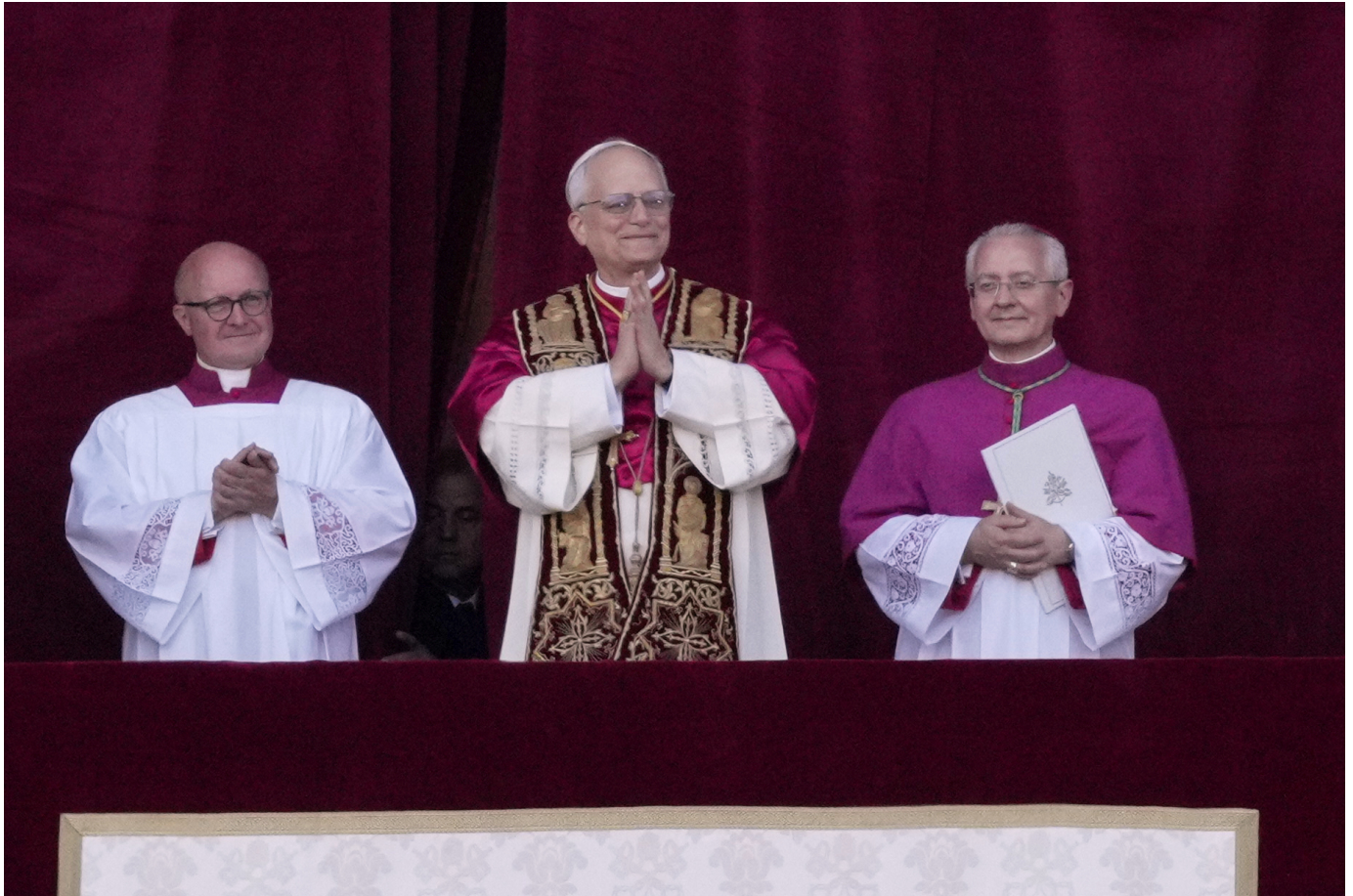
Newly elected Pope Leo XIV appears at the balcony of St. Peter's Basilica at the Vatican, on May 8, 2025.

While these students had gotten the chance to meet Leo XIV while he was a cardinal, some members of the Villanova community have known him for years.